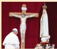
"Our Lady of Fatima invites us once again to turn to prayer, penance and conversion." —Pope Francis